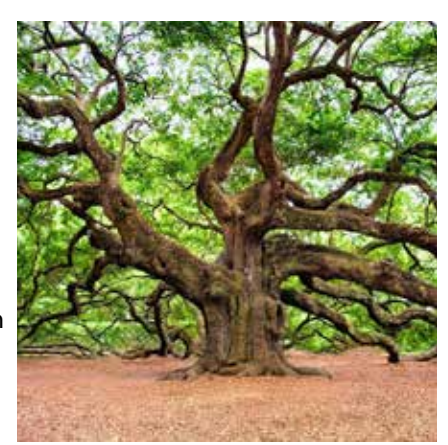
As our ancestors planted for us, so do we plant for future generations. ~ Ta'anit 23a Talmud

We invite you to include KBI in your will as a beautiful way to demonstrate your dedication and connection to our congregation, to our community, and to our future.